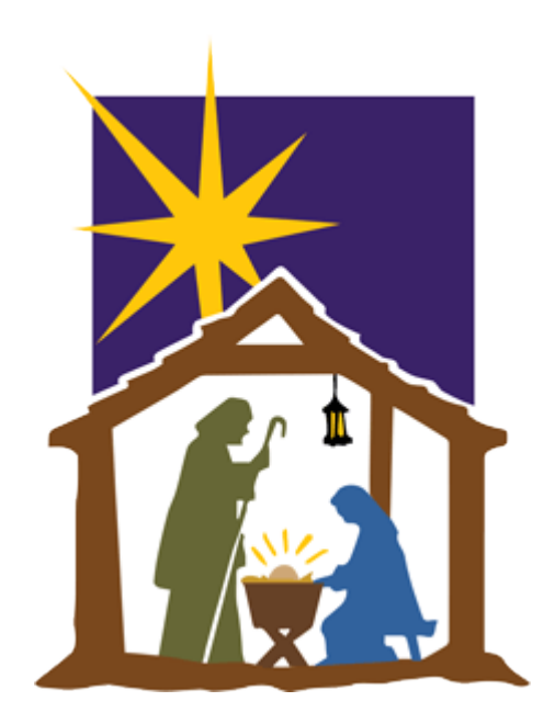
Newsletter Deadline is December 13 for the January 2025 Bethlehem Star. Also available at www.bethlutheran.org

In-Home Date: Saturday, November 30, 2024 Mailed on November 27, 2024